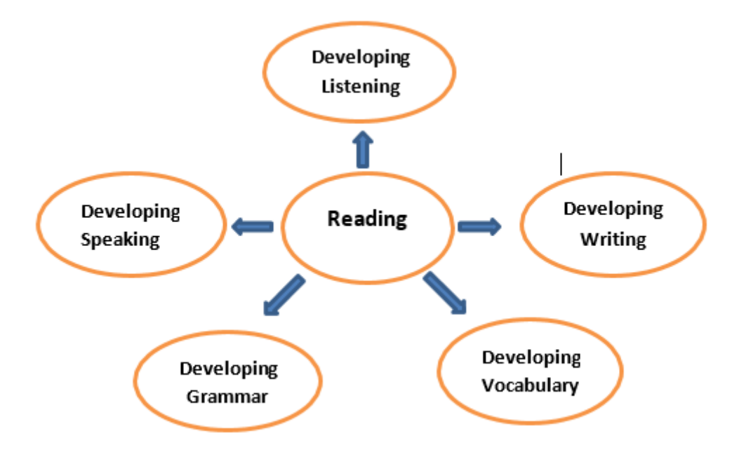
Figure 1.1 Placing Reading at the Centre of Language Learning (Grabe and Stoller, 2019, p.89)

The followin figure shows how reading can play central roles in improving language skills. Indeed, using reading to learn or to teach English as a foreign language has received significant attention in the area of ELT.